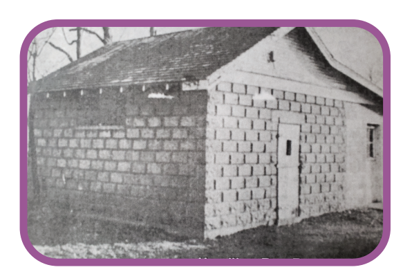
Hamilton Dog Pound in 1952

In the minutes of a meeting of the Butler County Board of Health held June 4, 1952, the County had confirmed 29 positive dog cases and 1 positive cow case of rabies since April 1st. The County spent $8,000 on rabies treatments for humans that summer and that was equivalent to nearly $90,000 in today's money. (The average annual income in 1952 was $3,515, gasoline was 27 cents per gallon, a loaf of bread was 16 cents, and a postage stamp was only 3 cents.). During the year 1952, more than 60 people were forced to take Pasteur shot treatments and three persons suffered post vaccinal reactions.