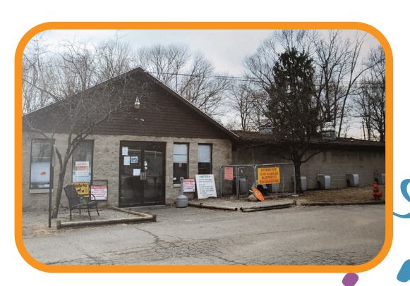
Trenton Shelter in 2008